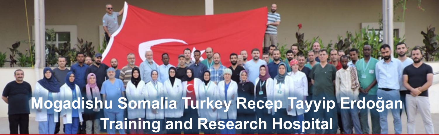
Mogadishu Somalia Turkey Recep Tayyip Erdoğan Training and Research Hospital