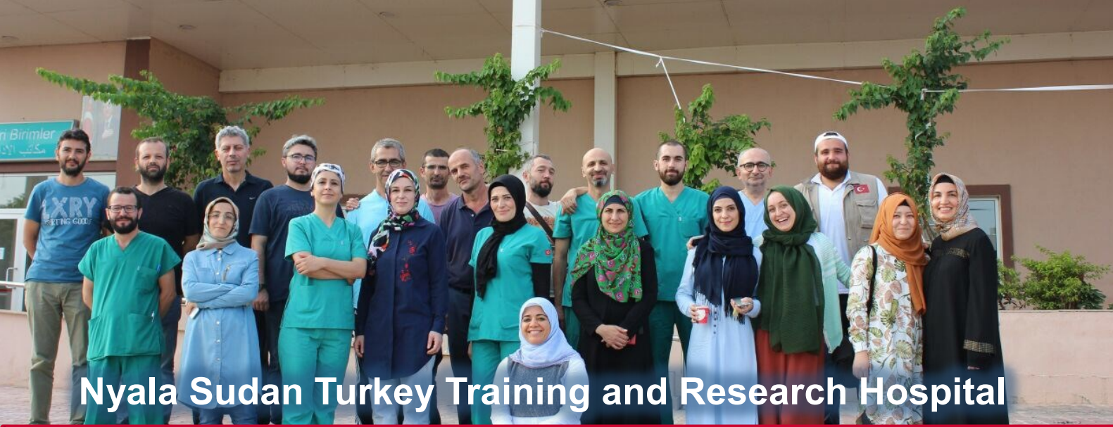
Nyala Sudan Turkey Training and Research Hospital